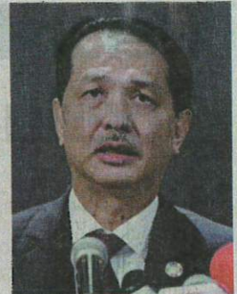
DR NOOR HISHAM