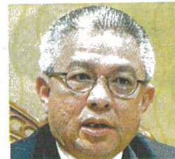
Dr Adham Baba

Beliau berkata, kerajaan memberikan komitmen yang tinggi