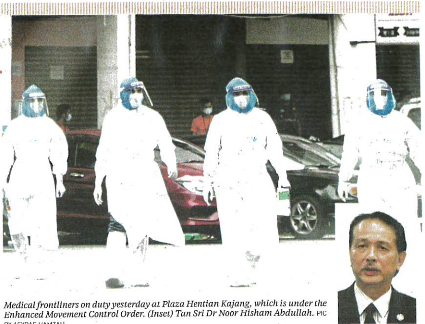
Medical frontliners on duty yesterday at Plaza Hentian Kajang, which is under the Enhanced Movement Control Order. (Inset) Tan Sri Dr Noor Hisham Abdullah.

"Usually, cases are found positive from Day seven to Day 13. If the cases are positive based on the second test, they will have to undergo another 14 days of mandatory quarantine."