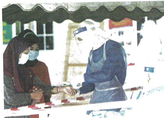
PETUGAS kesihatan memotong gelang merah jambu seorang penduduk Kampung Padang Che Mas, Baling selepas tempoh Perintah Kawalan Pergerakan Bersyarat (PKPB) tamat semalam.

"Wanita tersebut pulang dari Labuan pada 10 Oktober dan telah dikuarantin di Sarawak. Seperti biasa, kita menjalankan ujian pada hari pertama dan ia negatif," seterusnya pada hari