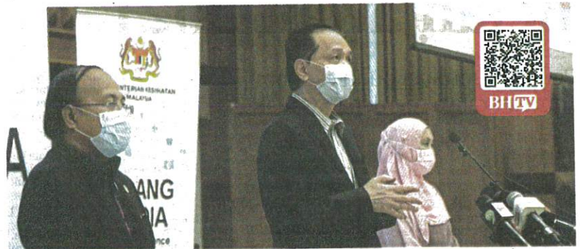
Dr Noor Hisham pada sidang media harian di Putrajaya, semalam.

Daripada 659 kes baharu semalam, ada satu kes import yang mendapat jangkitan dari luar negara, iaitu Bangladesh membabitkan bukan warganegara, dan bagi kes tempatan pula Sabah mencatat 529 kes, manakala negeri dan Wilayah Persekutuan di Lembah